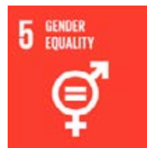
Goal 5: Gender equality