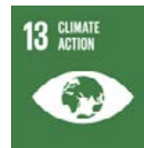
Goal 13: Climate action