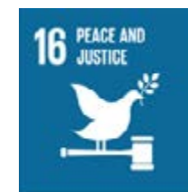
Goal 16: Peace & justice

You can choose to focus on any of the 17 Goals during this session! The poster showing all 17 is on page 17.