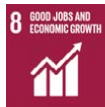
Goal 8: Decent work & economic growth